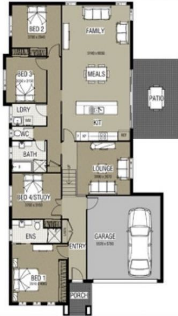
Avalon 204 Split Level Classic Floor Plan